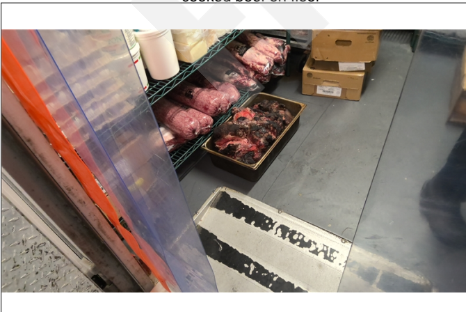
cooked beef on floor