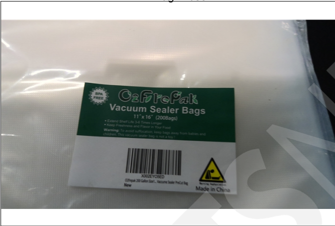
Bag in use