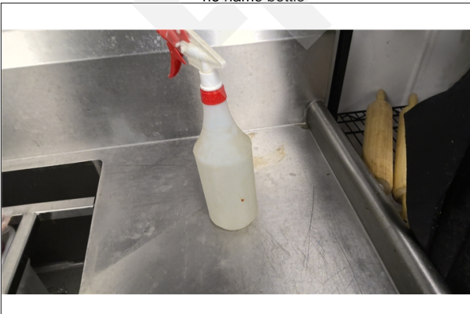
no name bottle