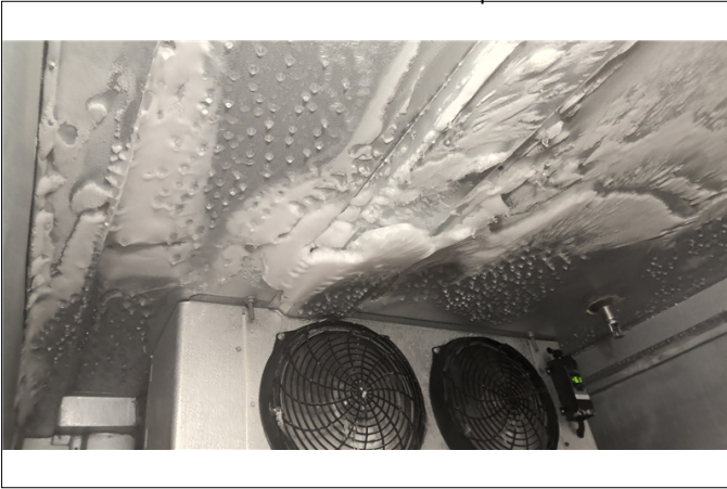
freezer ice build up