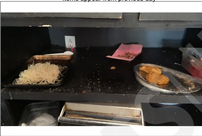
Items appear from previous day