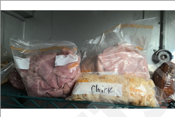
Deli meat and chicken no date