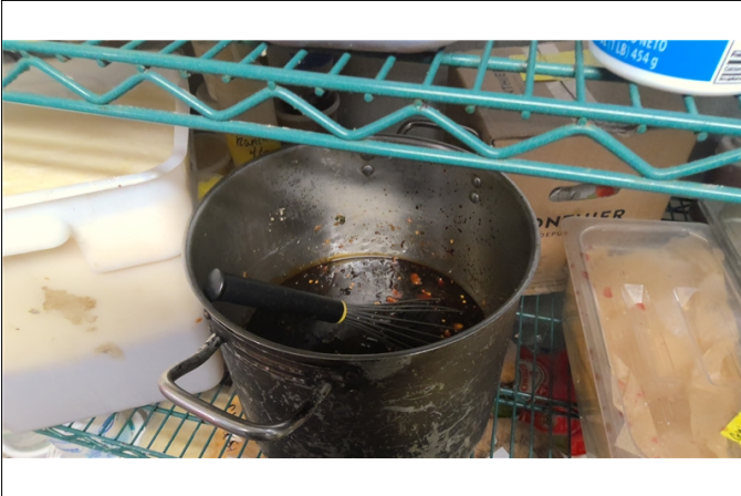
Two sauces without date