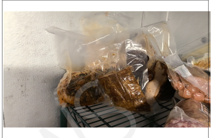
Cooked chicken and ribs no date